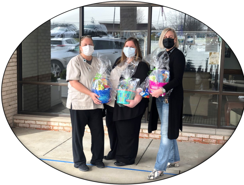
Shepherd of the Valley Boardman