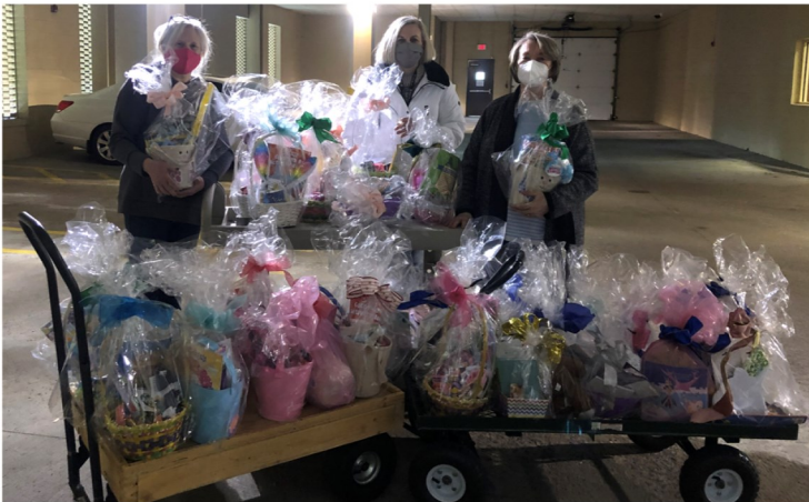
Delta Kappa Gamma