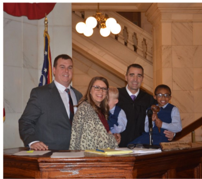
The Cain Family