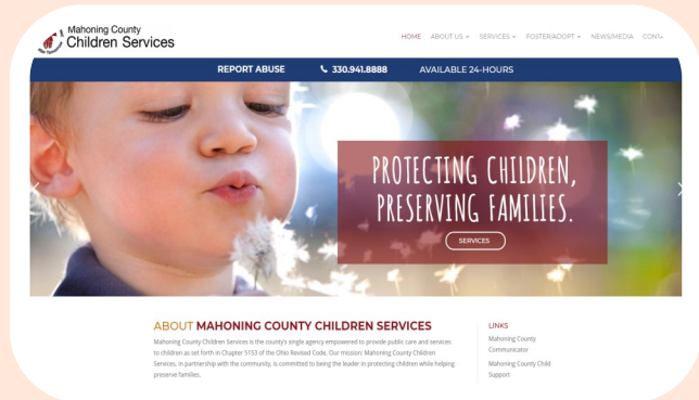
The new home page of mahoningkids.com