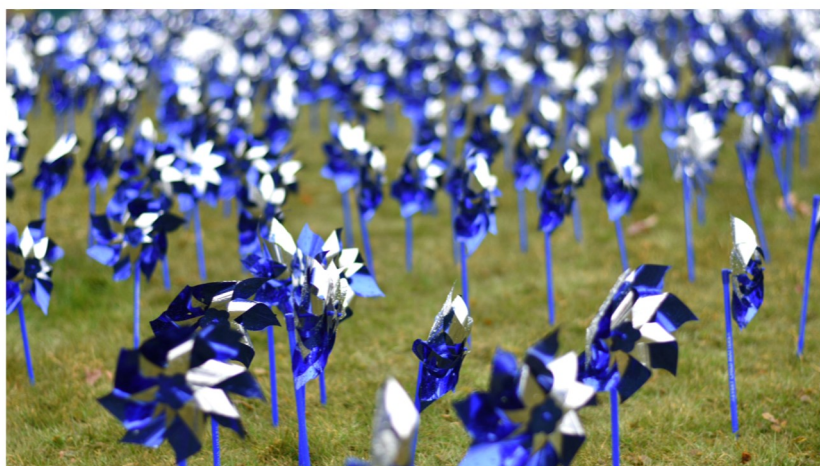
Pinwheels Spin in the Wind at Boardman Park to raise awareness of Child Abuse Prevention.

Each April pinwheels no matter the weather—sun, rain, sleet or snow are “planted” in communities across the nation to raise awareness of Child Abuse and Neglect Prevention Month. The pinwheel is the national symbol for child abuse and neglect prevention. The pinwheels represent individuals who advocated and took action on behalf of a child.