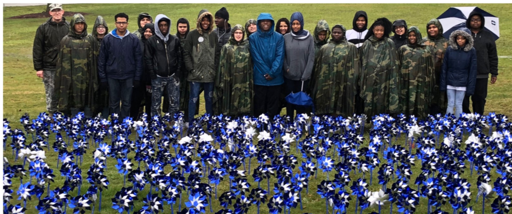
It takes an Army to Plant a Pinwheel Garden: The East High School Junior Army ROTC students helped plant over 2,000 pinwheels in Boardman Park to raise awareness of Child Abuse Prevention Month in April.