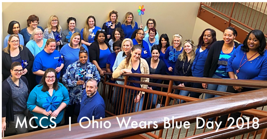
MCCS | Ohio Wears Blue Day 2018

Get the Blue Out: MCCS staffers wear blue for "Ohio Wears Blue Day" in support of National Child Abuse & Neglect Prevention Month in April.