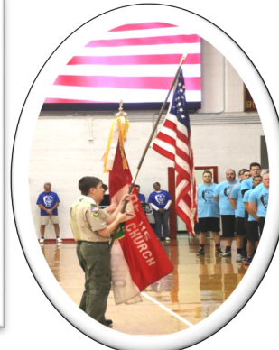
Boy Scout Troop #115