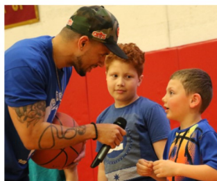
Half Court Contest Contestants