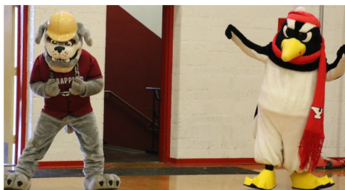
The Scrappy & Pete Show