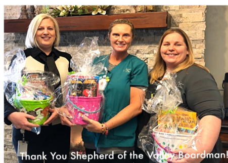
Thank You Shepherd of the Valley Boardman!