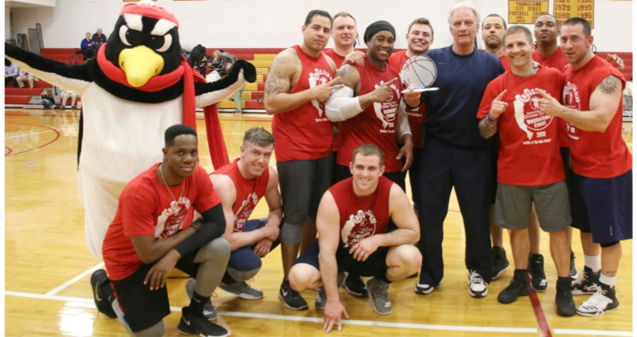
Celebration: Team YFD: 2018 "Battle of the Blue" Championship Game Winners.