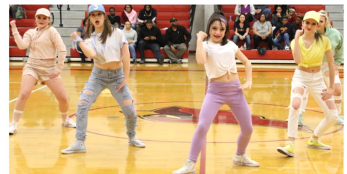
Jones Dance Academy Half Time Activities