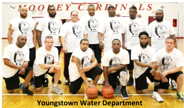
Youngtown Water Department