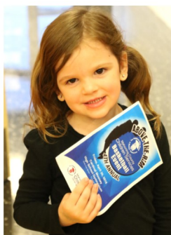
Our Fans are Little but Mighty