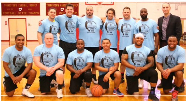
Youngtown Police Department