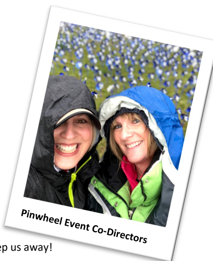
Pinwheel Event Co-Directors