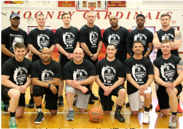
Mahoning County Sheriff's Office