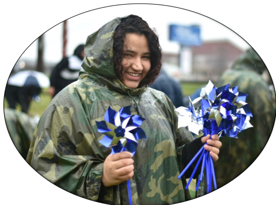
Rainy Day Pinwheel Planters: A little rain cannot keep us away!