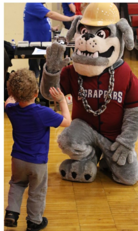
High Fives with Scrappy